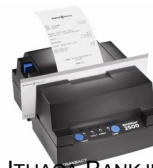
ITHACA BANKJET 2500